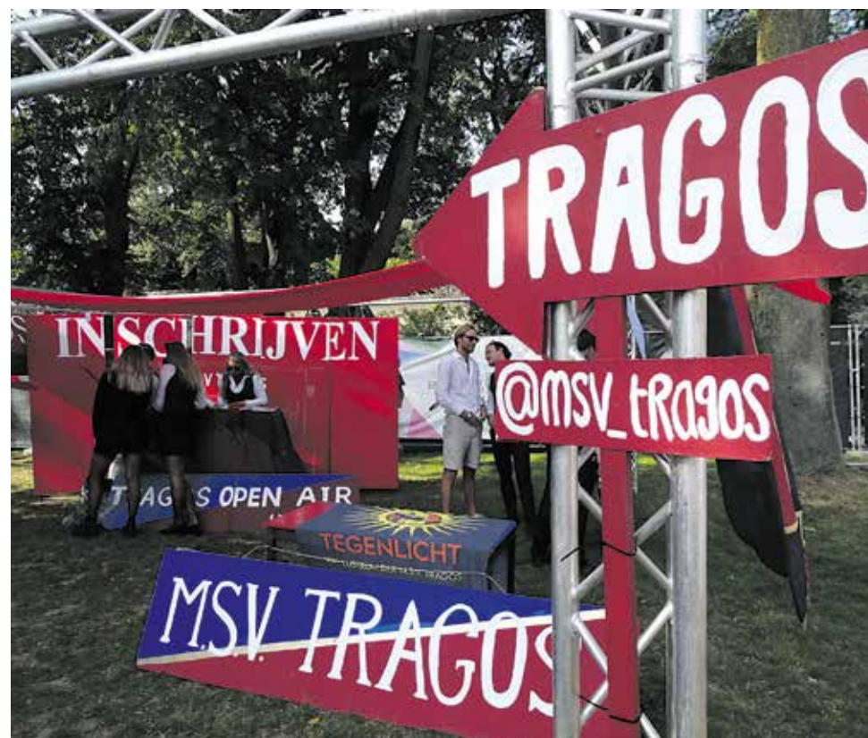
Tragos at the INKOM fair in 2024. This year, they were not permitted to take part, just like Circumflex.