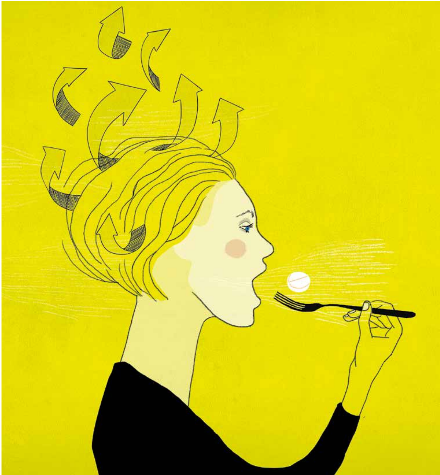
Illustration: Simone Golob

Some 10 to 20 per cent of students occasionally take Ritalin before sitting a difficult exam. The drug, intended for people with ADHD, is thought to boost study performance. But recent research from the Faculty of Psychology and Neuroscience (FPN) suggests it's not that easy.